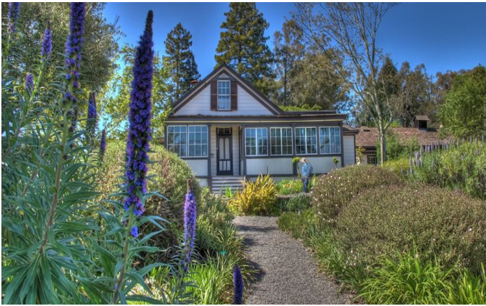
Jack London restored Cottage