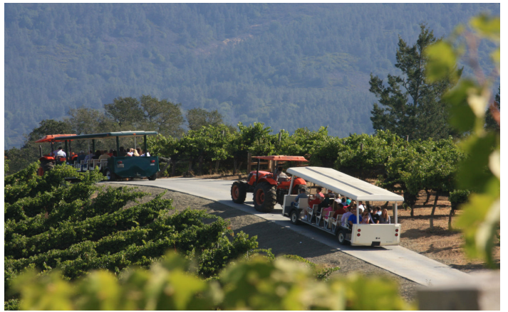
Benziger Winery Tram Tour