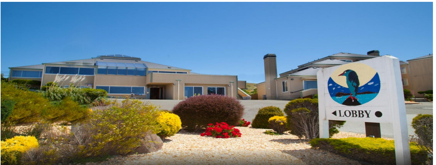
Bodega Coast Inn