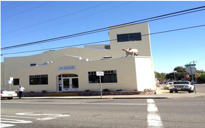
Petaluma Co-Op Creamery (Outside)