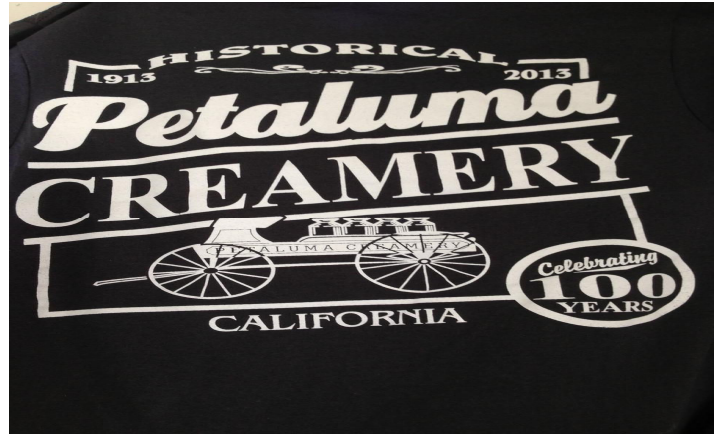
Petaluma Co-Op Creamery (Logo Sign)